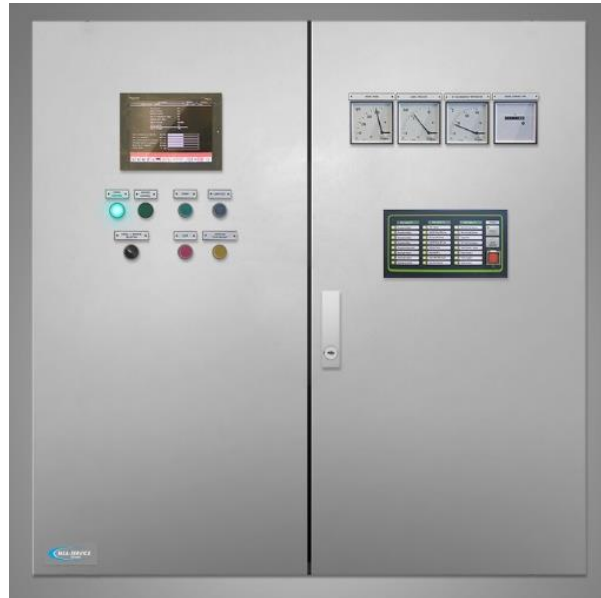
Cabinet for large engines